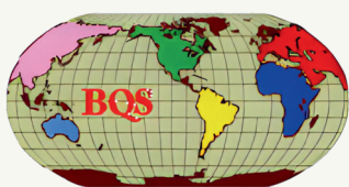
Board of Quality Standard